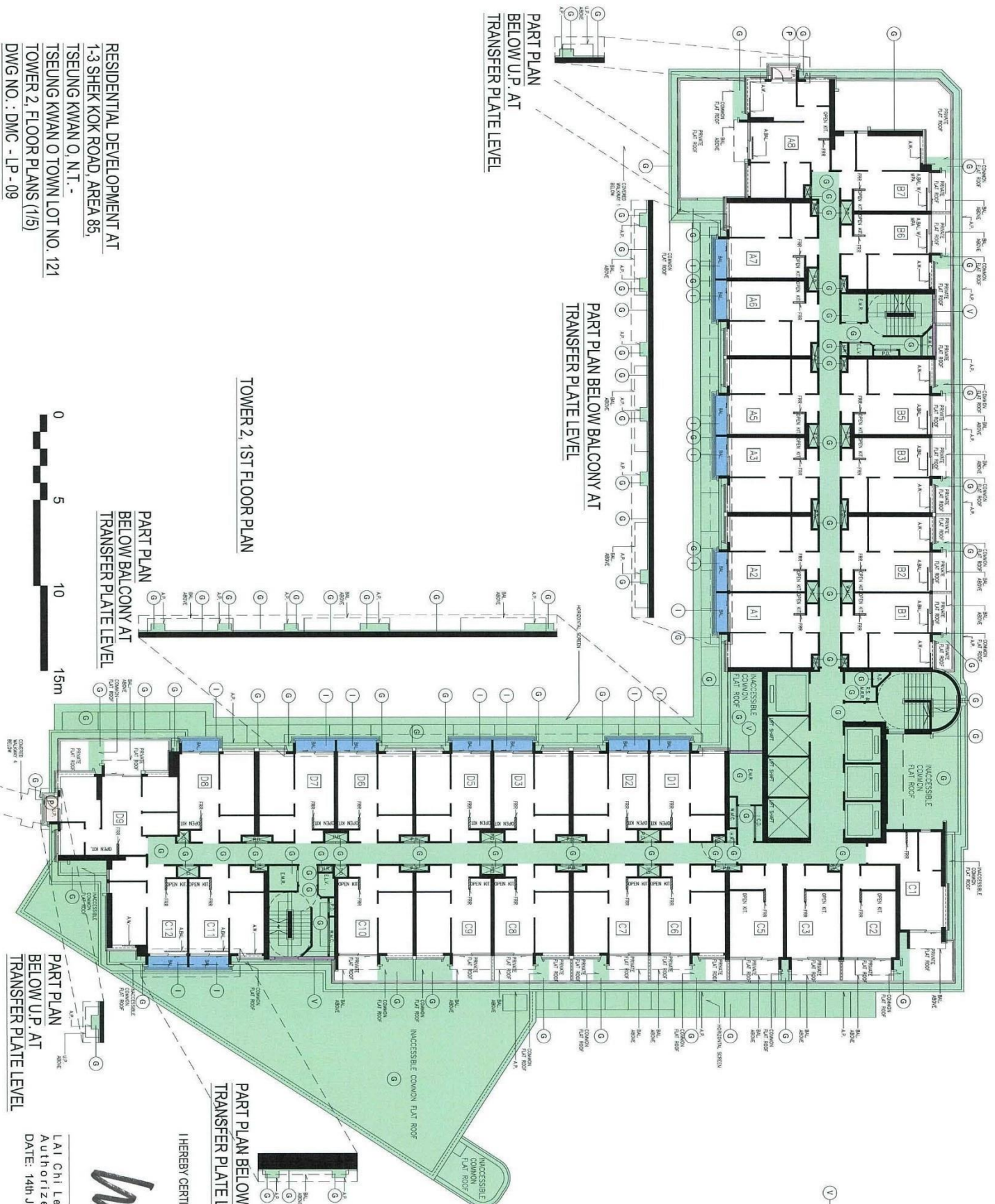
PART PLAN BELOW UP AT TRANSFER PLATE LEVEL